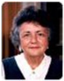
Chief Justice Shirley S. Abrahamson