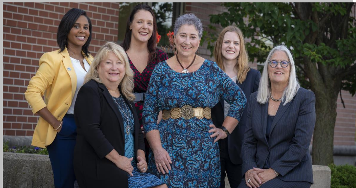
Welcome to our 2021-22 officers! Look for the September issue of Wisconsin Lawyer™ magazine for a feature on women as leaders in the State Bar.

Please continue to stay well and, as always, ever forward!