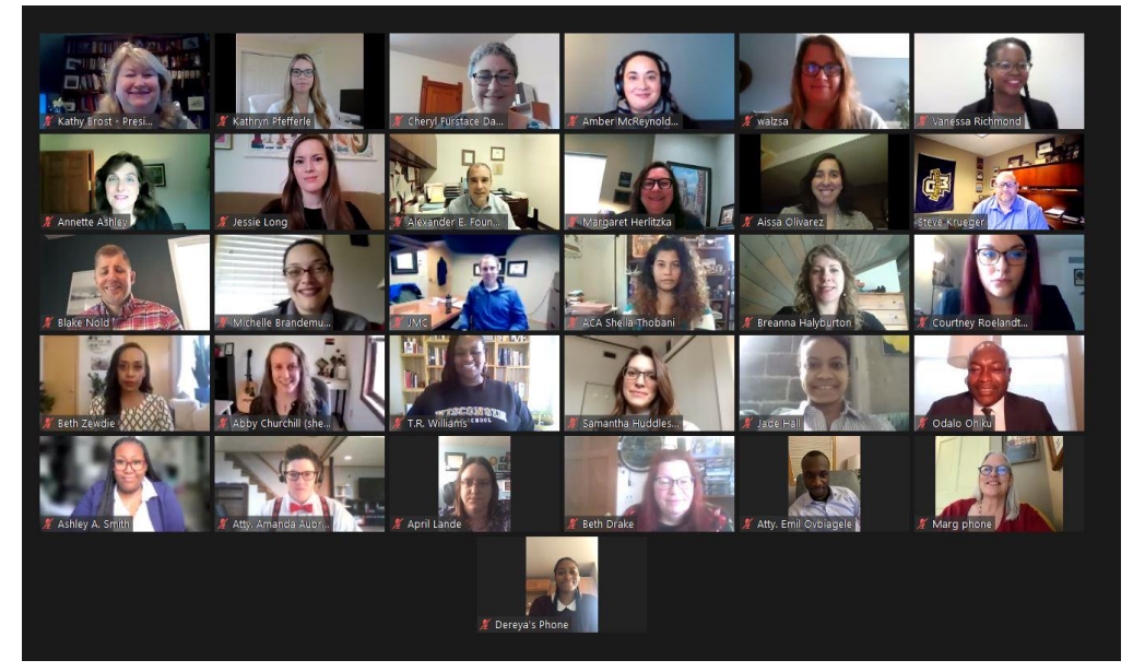
Twenty-six potential future leaders in the legal community attended the State Bar Leadership Summit on April 10.

Participants in past summits have gone on to serve in leadership positions with the State Bar and with their local and specialty bars. Those who make a volunteer service commitment are eligible to receive an AMC scholarship made possible through the Wisconsin Law Foundation.