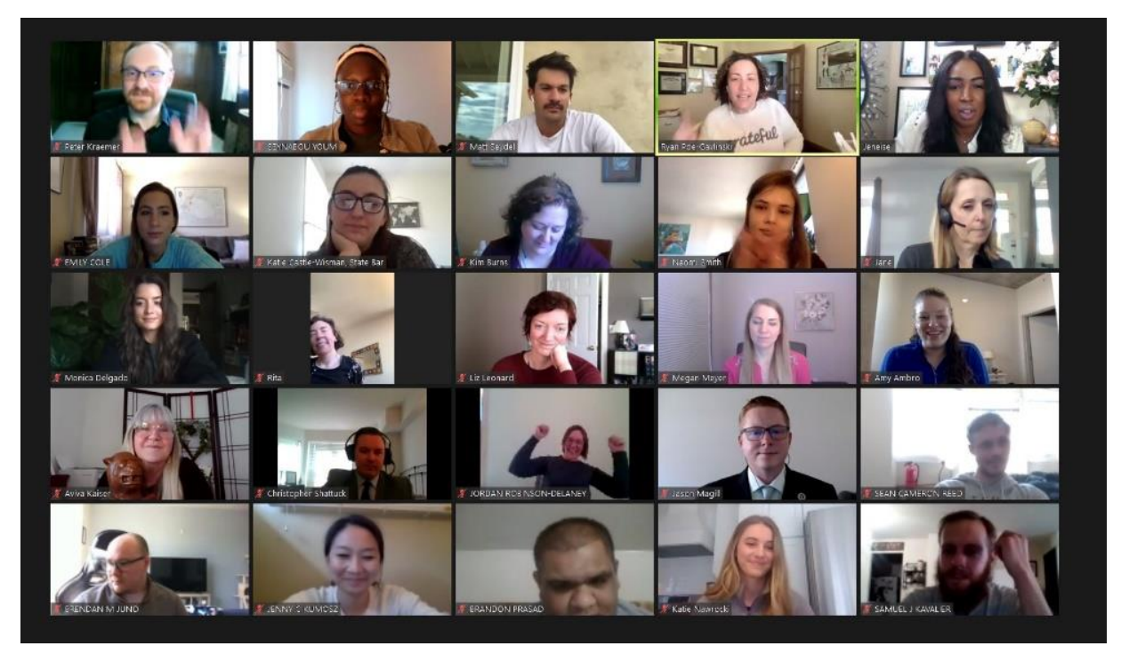
Welcome! Acquainting U.W. Law Students with the State Bar

Thirty-nine 3L students in the U.W. Law School's Lawyering Skills class received a warm welcome from State Bar staff during a virtual visit on April 1. They learned more about State Bar services and products available to them as students and practicing attorneys.