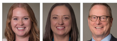
NOVAK STORM WIRTH