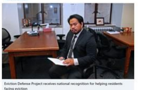
Eviction Defense Project receives national recognition for helping residents facing eviction