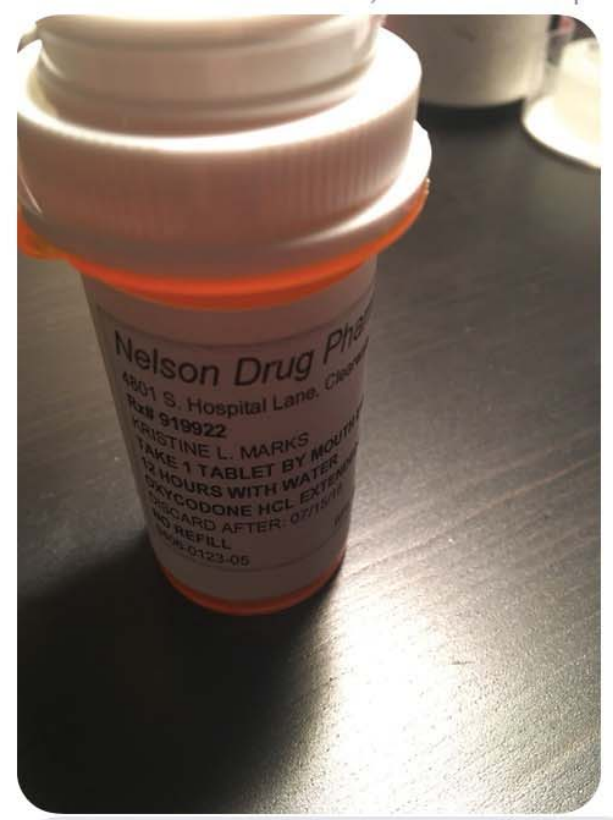
Hey... check out what I scored tonight! ♥